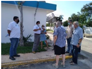
Representatives of Akumal Norte and Central Akumal discussing the plant's capacity with the Director of CAPA.

This week I reached out to our partners in Central Akumal to schedule our first negotiations to find an answer. Negotiations will include finding a path and determining the costs and how they will be shared. The project will take time and require us to work closely together. In the end the protection this offers to saving Akumal Norte's natural environment will be well worth it for us and generations to come. We will keep you posted as discussions continue.